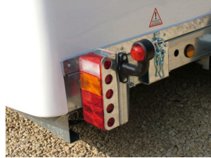
WELL PROTECTED LIGHTING SYSTEM WITH "SUPERSEAL" WIRING CONNECTIONS