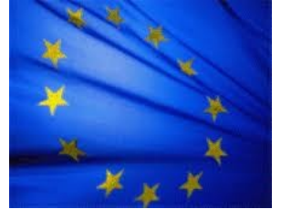
FULL EU TYPE APPROVAL