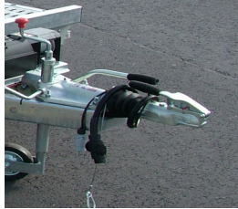
BRADLEY AUTO LOCK CAST BODY AND CAST HEAD COUPLING